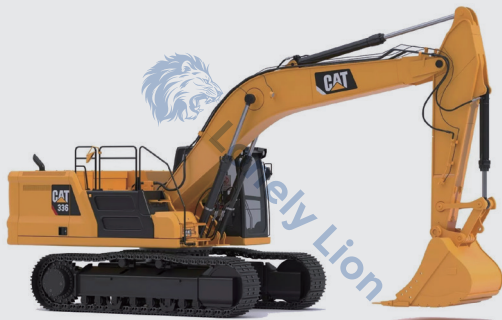
GRABEXCAVATOR CAT (NEW · USED)