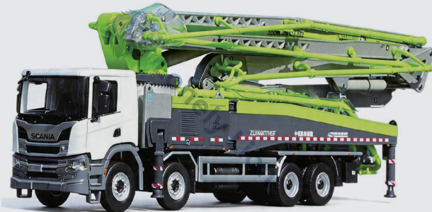
PUMP TRUCK ZOOMLION (NEW · USED)