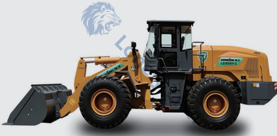
LOADER LONKING (NEW · USED)