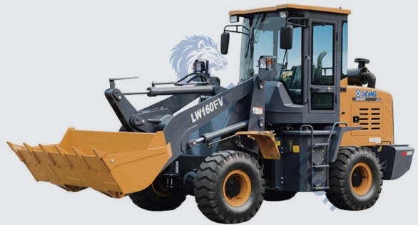
LOADER XCMG (NEW · USED)