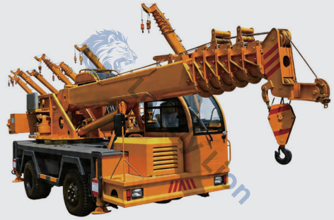
CRANE (NEW · USED)