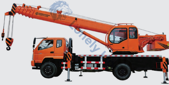
CRANE (NEW · USED)