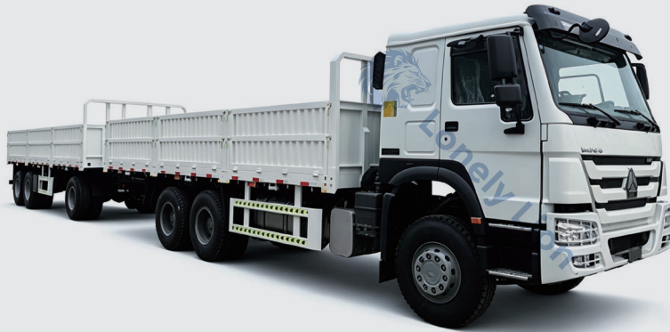
HOWO mid-axle trailer