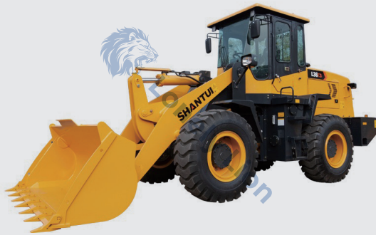
LOADER SHANTUI (NEW · USED)