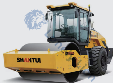
ROAD ROLLER SHANTUI (NEW · USED)