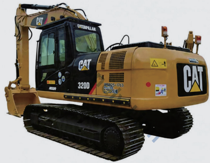
GRABEXCAVATOR CAT (NEW · USED)