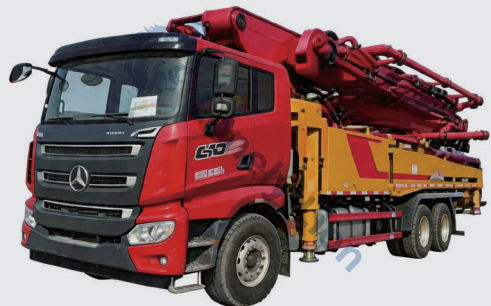
PUMP TRUCK SANY (NEW · USED)